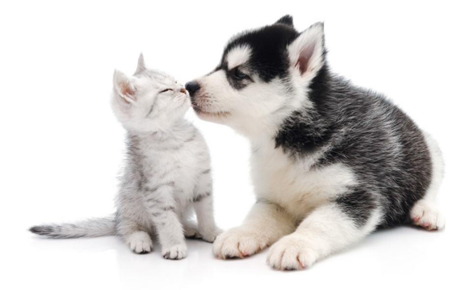
DOG and CAT LifeCycle